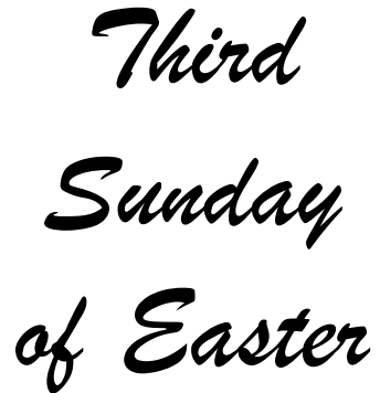
April 14, 2024

St. Paul Ev. Lutheran Church Church of the Lutheran Confession In the People Place - Vernon, B.C.